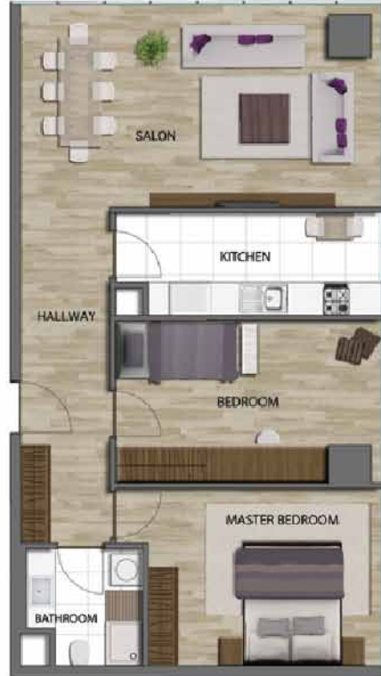
2+1 (GROSS AREA: 110.37 m²)