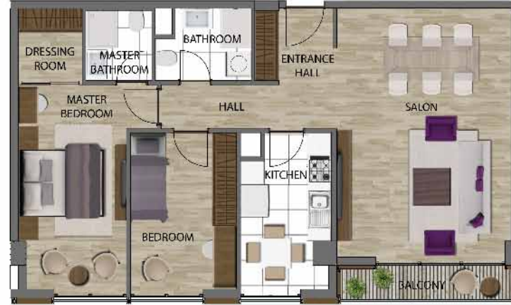
2+1 (GROSS AREA: 118.72 m²)